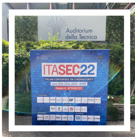
BILLBOARD (cm 200 x 200)