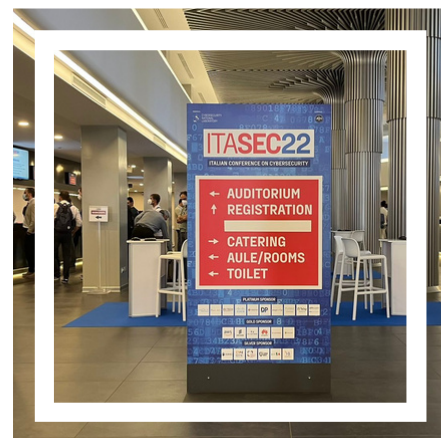
SIGNAGE (cm 200x 200)