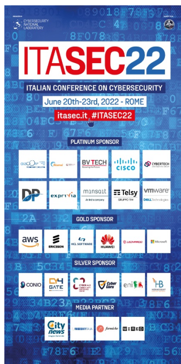
Figure 4.2 – ITASEC22 Roll Up (cm 100 x 200)