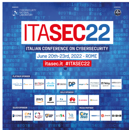
Figure 4.1 – ITASEC22 Billboard (cm 200 x 200)