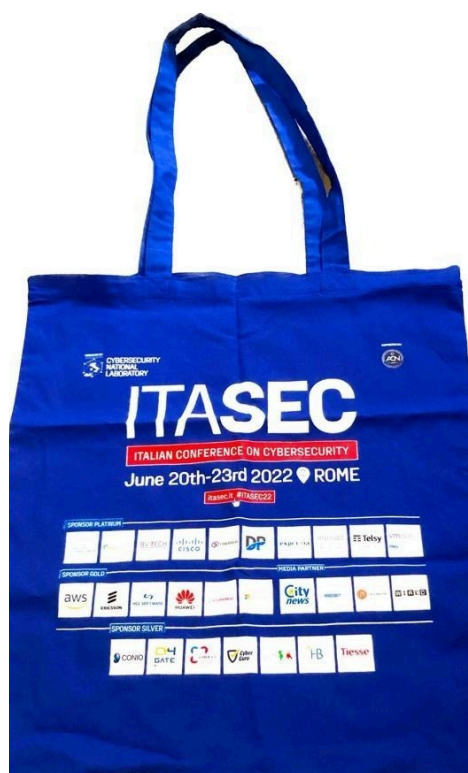
Figure 4.3 - ITASEC Conference Bags