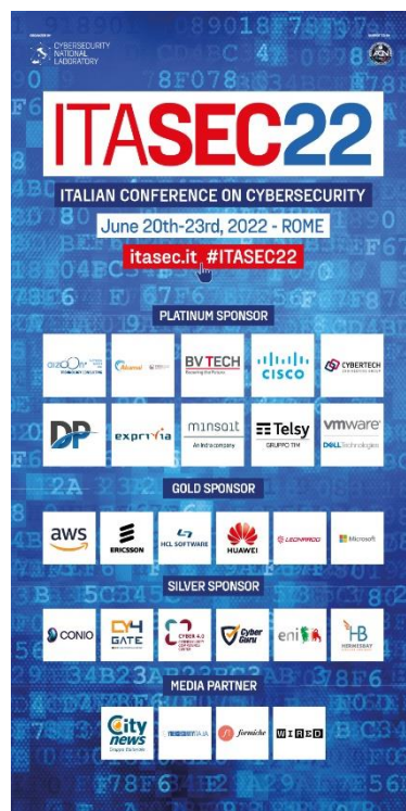
Figure 4.2 – ITASEC22 Roll Up (cm 100 x 200)