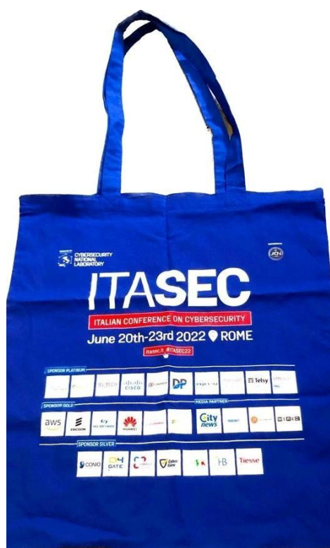
Figure 4.3 - ITASEC Conference Bags